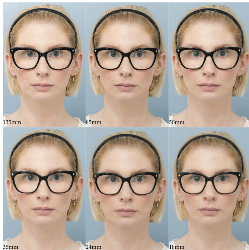
Fig 6. Images from figure five cropped to match framing. These images can be matched and look identical. In fact, the perspective is the same in all because the camera-to-subject distance is identical. The lens doesn't matter.