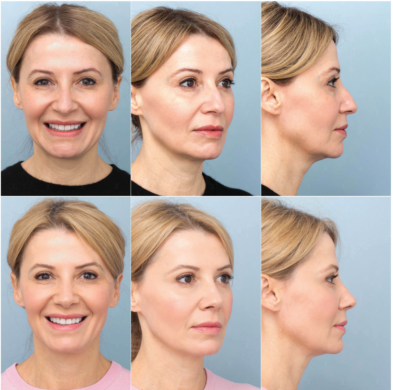
Fig 16. Before and after rhinoplasty using all techniques outlined in this paper