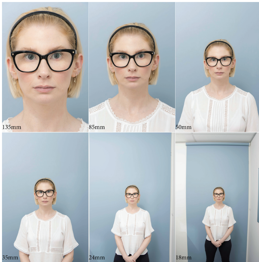
Fig 5. Images all shot from 1.5 m (5 ft) but with decreasing focal lengths