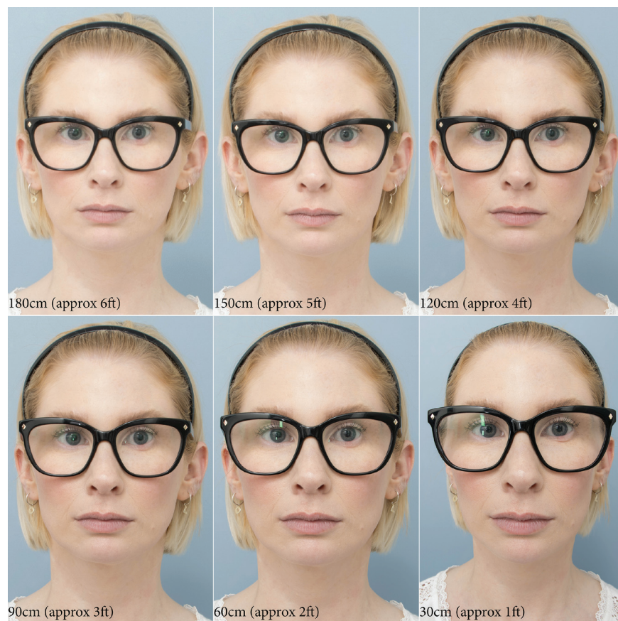
Fig 8. Images from figure seven cropped to match framing. These images could never be matched. Notice how at distances over about 1m (3 ft) the images start to look normal, but under 1 m (3 ft) there is considerable perspective distortion.