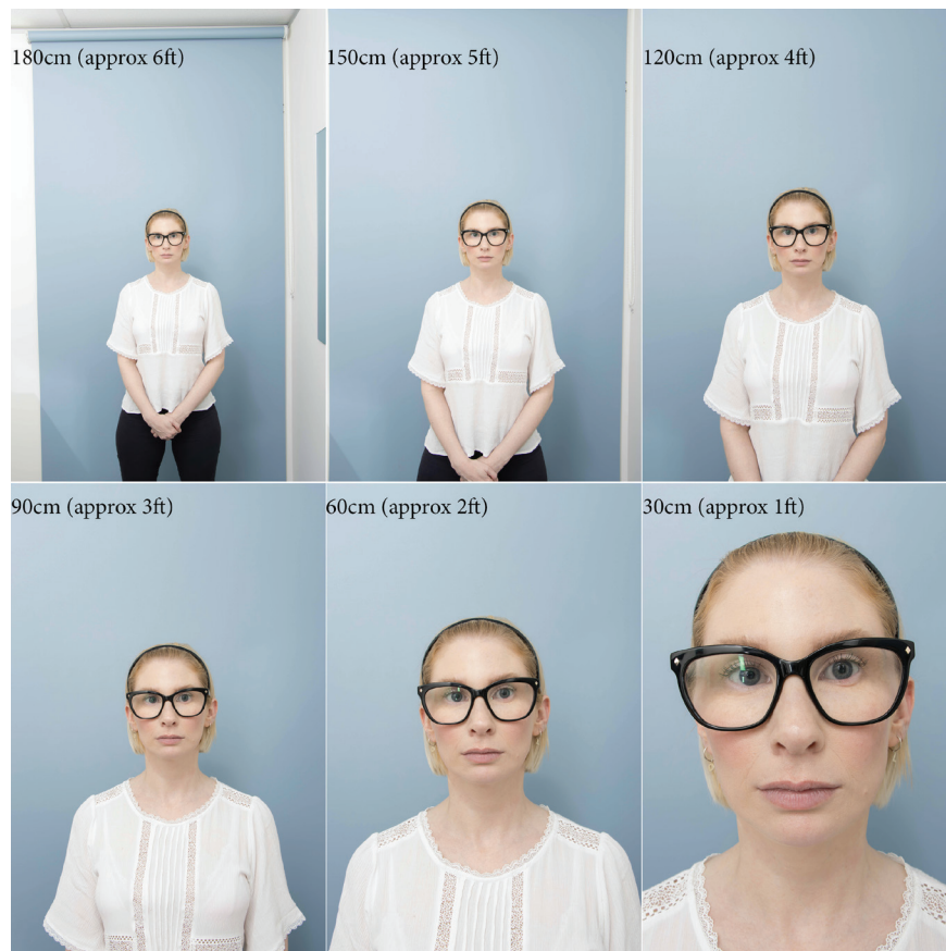
Fig 7. Images all shot with a 24 mm lens but at a decreasing camera-to-subject distance.