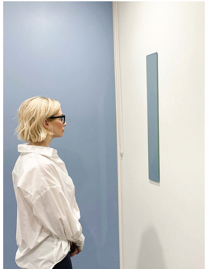
Fig 10. Patient looking in mirror for 90-degree view.

The camera lens barrel should be parallel to the floor and walls and at the level of the subject's eyes, with the focal plane being at the eyes when the subject looks straight ahead or obliquely. With side views the side of the cheek is easiest to use for the focal plane. Depth of field extends in front of and behind the focal plane. Relaxed and expressive views need to be consistent. Having the preoperative shots available for reference is helpful.