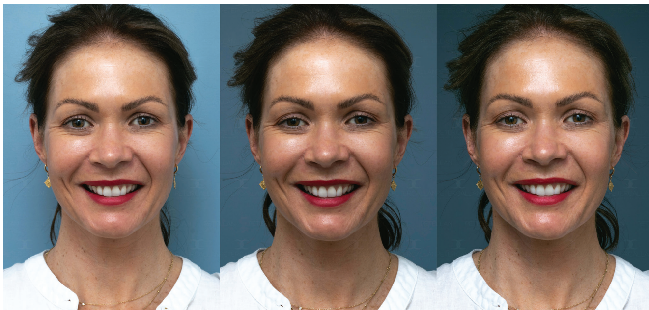
Fig 2. The effective of changing relative distances from light source, subject and background. In left image subject is close to background. In the middle and right-hand image, the subject and light source move further away from the background but the distance of the light source to the subject remains relatively constant. Despite exposure of the subject varying a small amount only (due to the conditions of the demonstration), the background gets significantly darker.