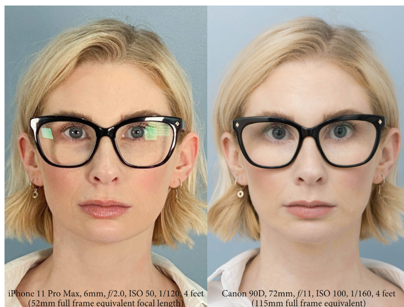
Fig 9. Smartphone versus DSLR. Perspective is identical as both are shot from 1.2 m (4 ft). Exposure matching, resolution and depth of field differ.

(4 ft) and less than 3 m (10 ft) is the recommended range. It just must be the same CSD each time. Work out a comfortable distance to stand between 1.2 and 3 m (4 and 10 ft) as your photographic area and camera demand and mark it.