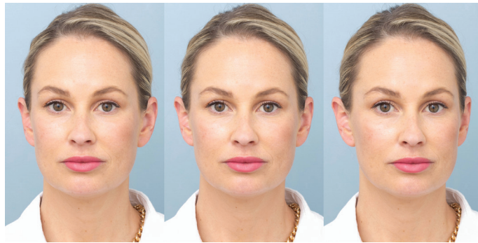
Fig 14. Z axis pan or yaw front view, middle image is neutral.